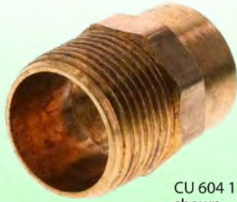
CU 604 1 shown