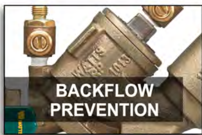
for Backflows and Parts

Scan the QR Code for our complete online catalog.