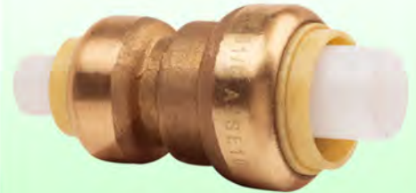
PUS CPL 1 shown