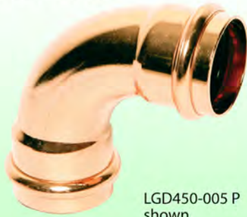
LGD450-005 P shown