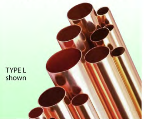
TYPE L shown