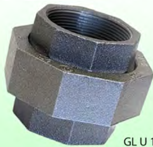
GL U 1 GALV shown