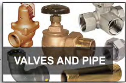
for Pipe, Fittings, and Valves

Or, you can call to speak to one of our Backflow Experts. We will make sure you have what you need for the job.