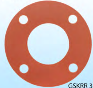
GSKRR 3 FF shown