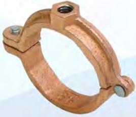
GL CT-138R-1 shown