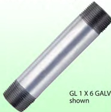
GL 1 X 6 GALV shown