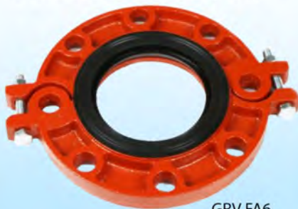
GRV FA6 shown